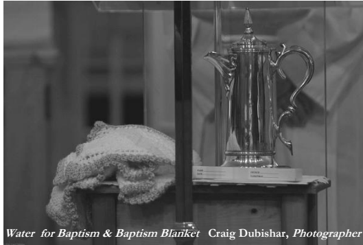
Water for Baptism & Baptism Blanket