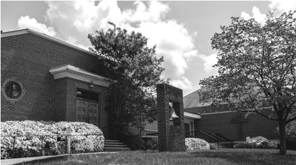
Front Entrance facing Van Buren St.